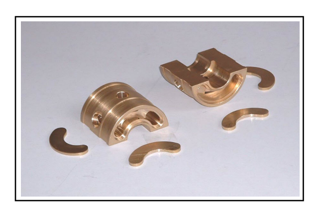
Brass heat sink