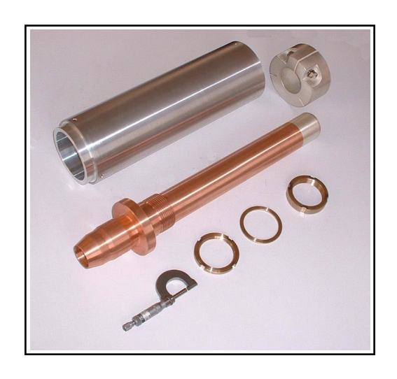
Copper component with an aluminium protection sleeve