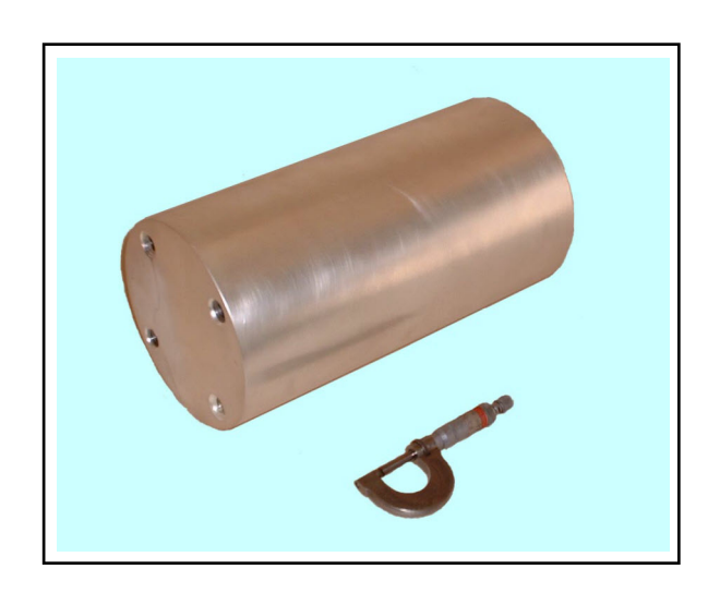
Fully silver plated aluminium connector