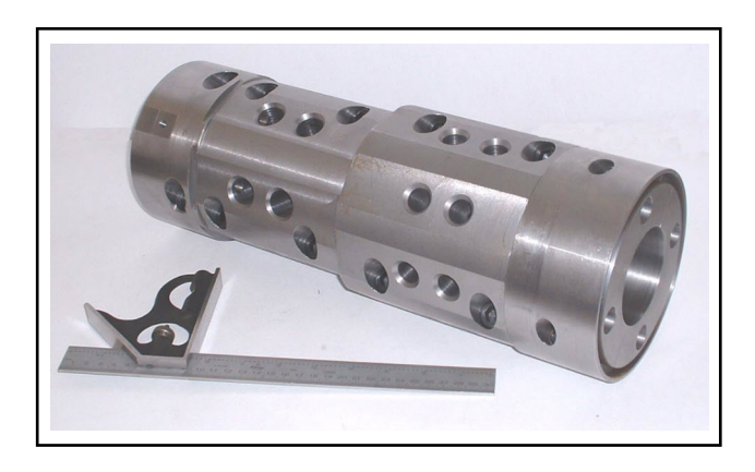
A mild steel multi-position indenting tool